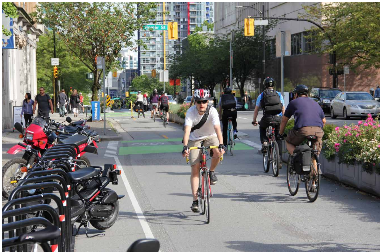
By designing streets to serve pedestrians, bicyclists and transit – including by adding infrastructure like this separated bike lane in Vancouver – cities can encourage low-carbon transportation and make streets safer for everyone.

Cities and transit agencies need to maintain, expand and improve public transit service. There are many ways to do this, including