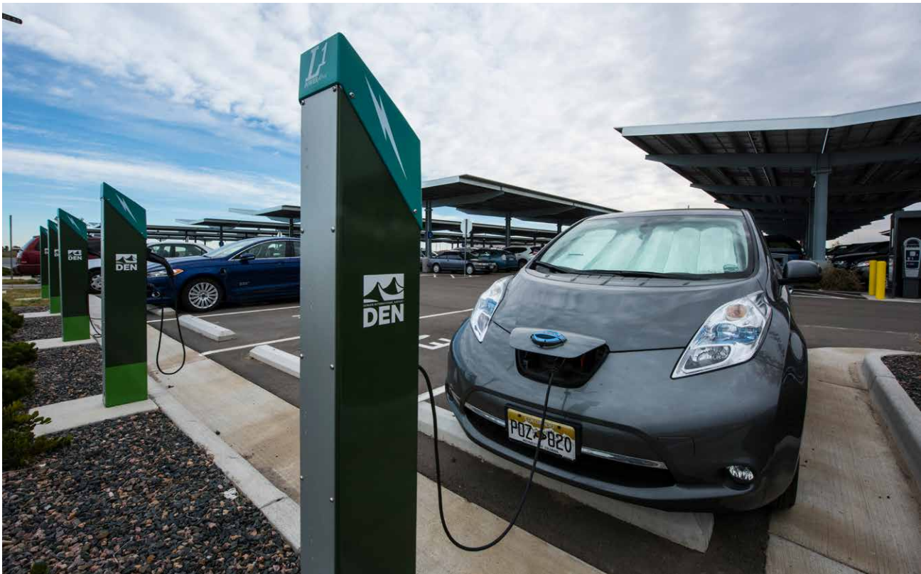
This electric vehicle charging station is powered by solar panels installed on a parking canopy. Because electric vehicles can be powered by clean energy sources including wind and solar power, they can enable a transition to a zero-carbon transportation future.

A growing body of research links noise pollution to a wide range of serious health impacts. 251 These include increased risk for cardiovascular disease and atrial fibrillation – which can increase the risk of heart failure and stroke – elevated stress levels, and impaired mental health. 252